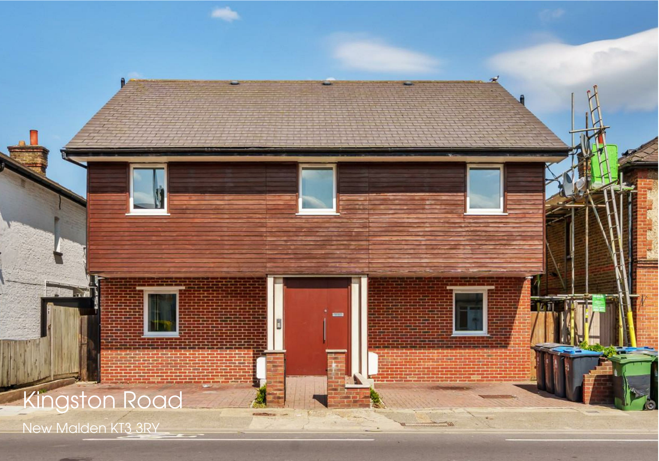
Kingston Road New Malden KT3 3RY